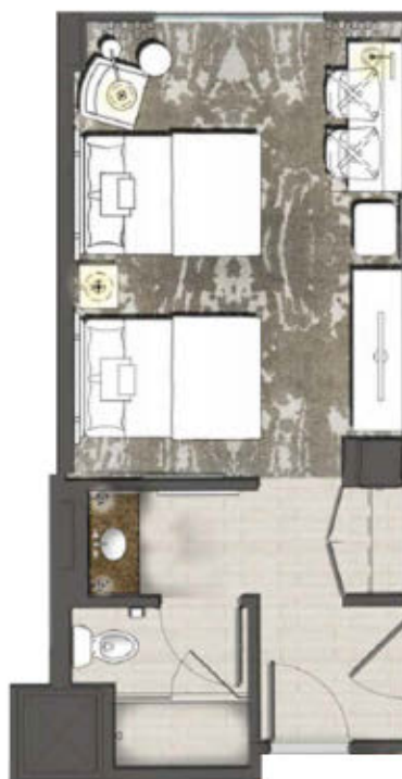
Standard Room Pool View Room / Lagoon View Room 335 sq ft