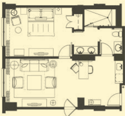
King Suite - 595 sq ft